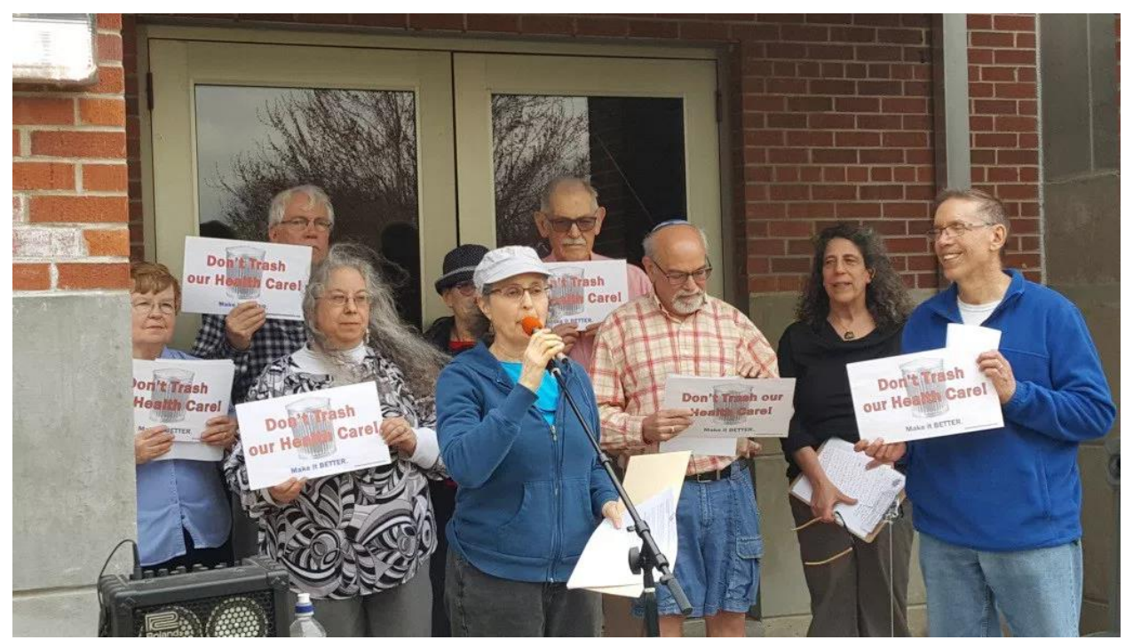
On April 9, FTW presented Trashed? Don't Trash Our Health Care. In the weeks leading up to the event, we gathered stories from Wisconsin residents around the state, illustrating the importance of the Affordable Health Care Act in preserving their health and their lives. (see

Forward Together Wisconsin sponsored two events this spring. On March 19, we held a vigil at the state capitol on refugee and immigrant rights. LGBTQ rights, health care reform and climate change. See coverage at <a href="http://www.nbc15.com/content/news/Candle-light-vigil-raises-awareness--416569553.html">http://www.nbc15.com/content/news/Candle-light-vigil-raises-awareness--416569553.html</a>.