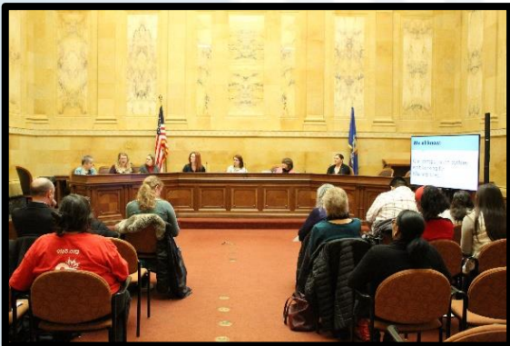
Dignity at Work legislative briefing

For more information, including the current full list of member organizations, see www.dignityatworkcoalition.org . Also like us on Facebook at www.facebook.com/dignityatworkcoalitionwisconsin . To join the Coalition email dignityatworkcoalition@gmail.com .