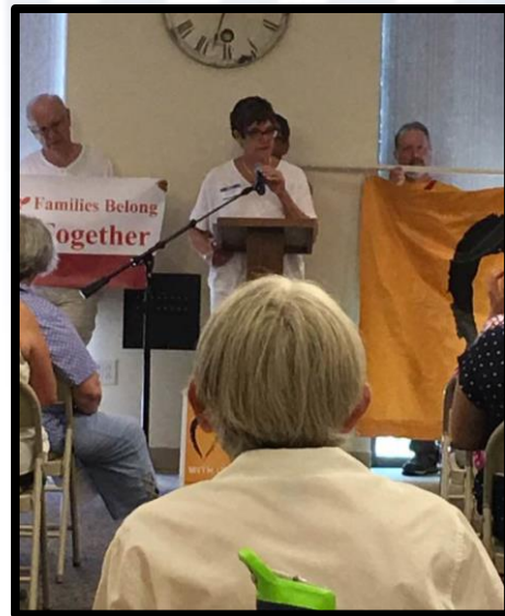
Press conference on separation of families

Forward Together Wisconsin is a state-wide, intentionally inclusive and diverse moral movement that brings together a broad coalition of individuals and organizations. We are led by personal conviction, faith or philosophy and are committed to work through nonviolent action for