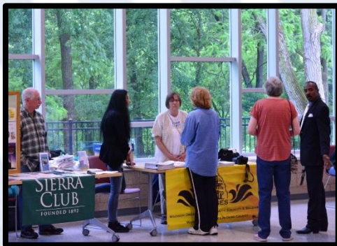
Exhibitors at the Fair